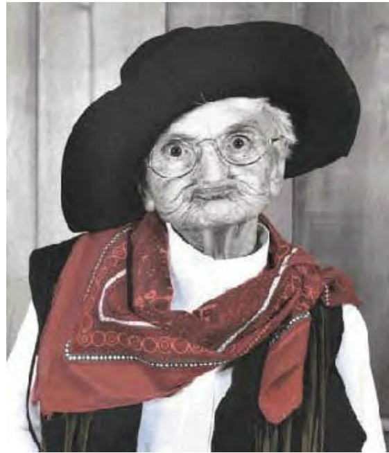
"That's the problem with calling "CQ Field Day" too long!"