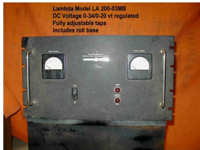
Lambda Model LA 200-03MB DC Voltage 0-34/0-20 vt regulated Fully adjustable taps includes roll base