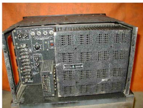
LAMBDA model 200-03BM 0-34 Volt DC 0-20 V Regulated Fully Adjustable taps