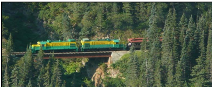
Above: scene from the White Pass railroad in Skagway Alaska.