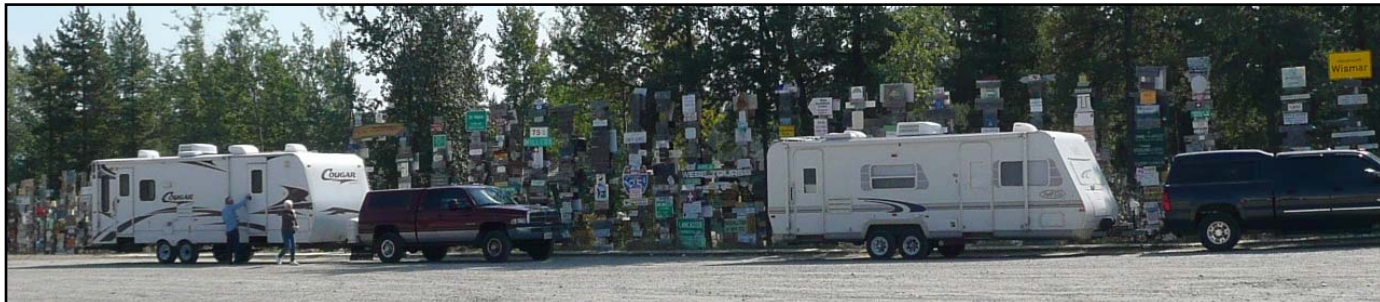
Above and below: The intrepid adventurers stopped at the Sign Forest, a tourist attraction made of thousands of signs from all over North America. Part of their journey involved travelling through territory ravaged by a massive forest fire, below in the distance.